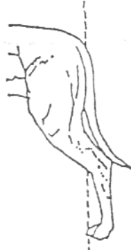
jarret trop long