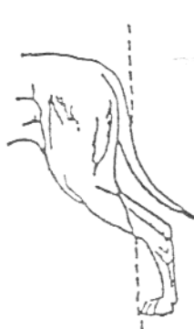
angulation trop accentuée